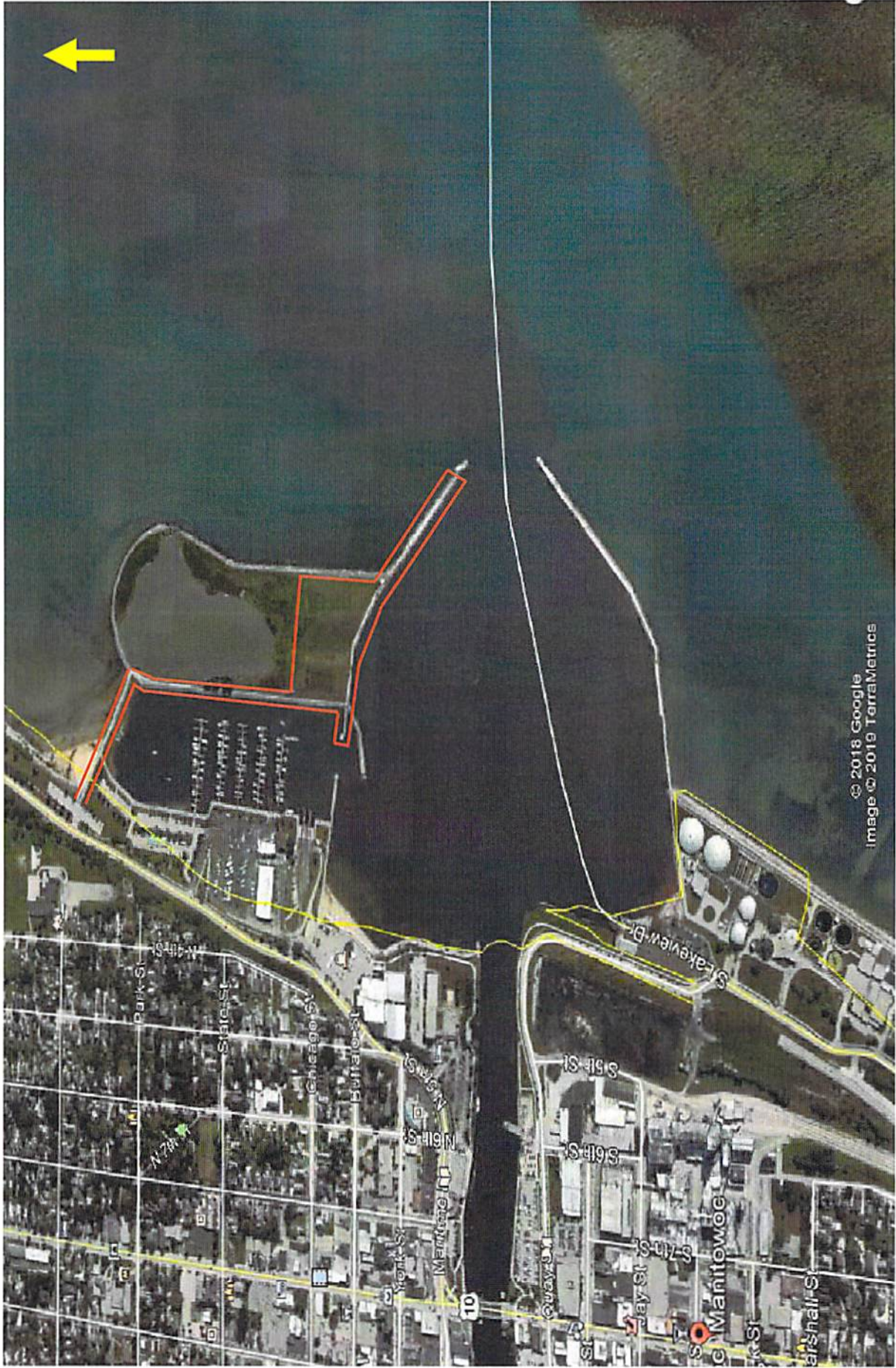
The approximate area (zoomed out) used by the city is delineated above in red.