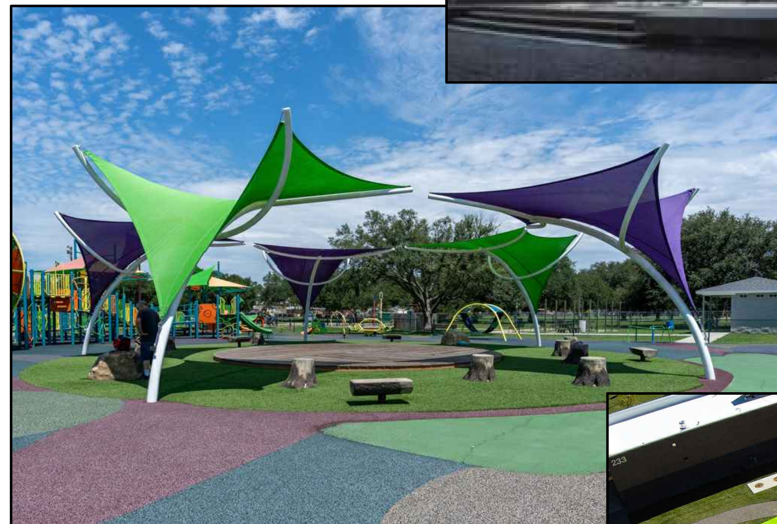
STAGE / SHADE SYSTEM