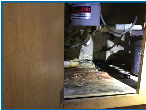
Some pictures showing the issues we are having at Riverview Apartments.