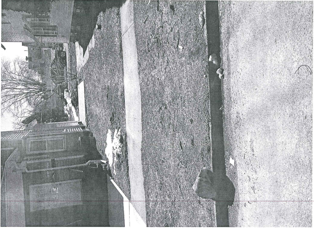
Location for new d-way