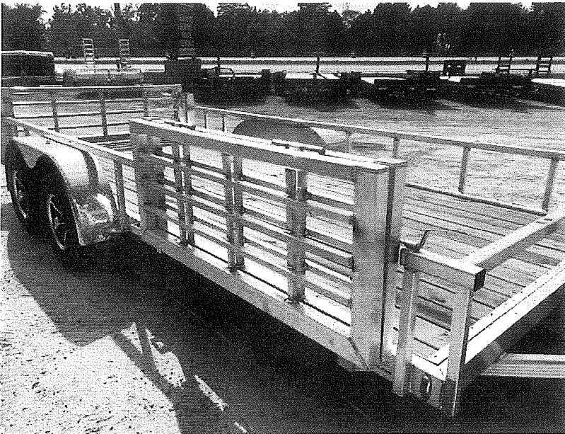
Picture above shows optional side bi-fold ramp gate & Alum. Spoke Wheels