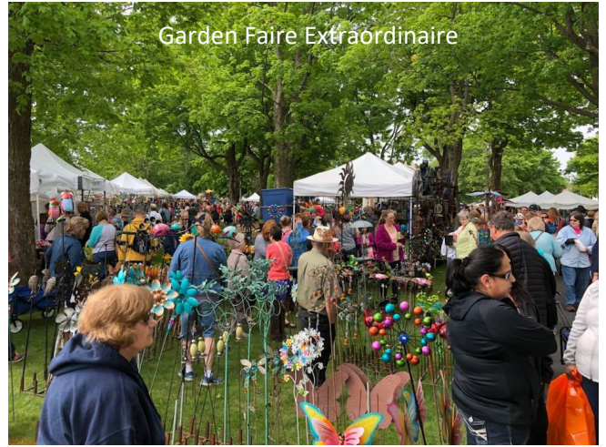
Garden Faire Extraordinaire