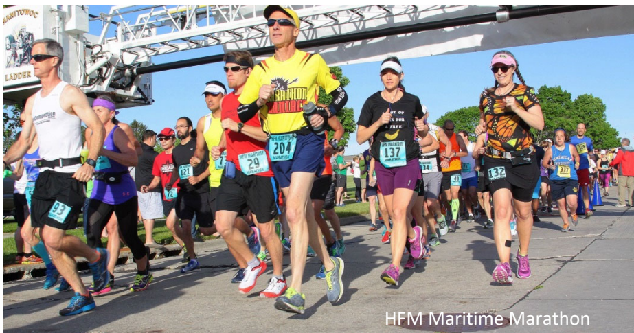
HFM Maritime Marathon