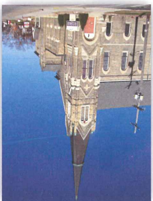
First Presbyterian Church 502 N. 8th St. Manitowoc, WI 54221

Community Dinners at First Presbyterian Church