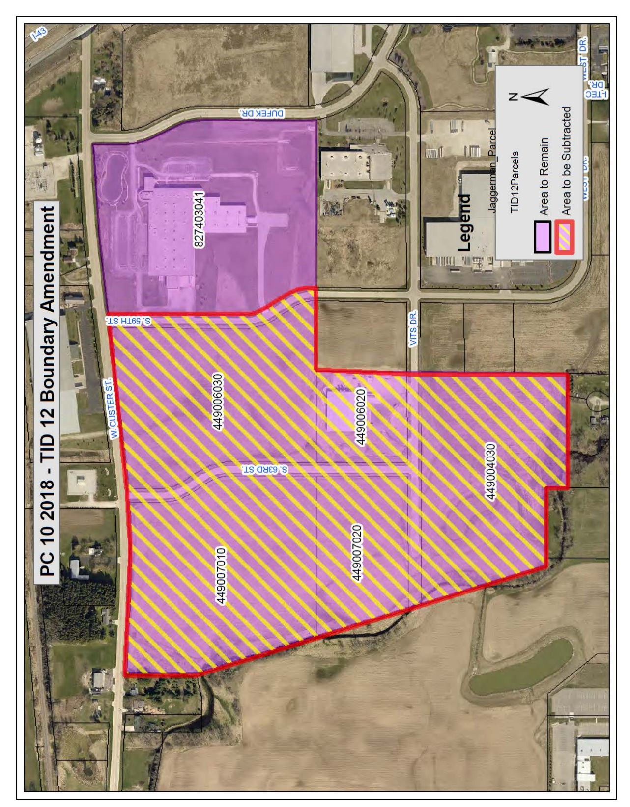
Map 1: District Boundary Amendment