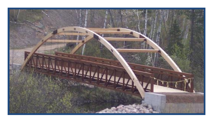
Wheeler PREFABRICATED STEEL BRIDGES