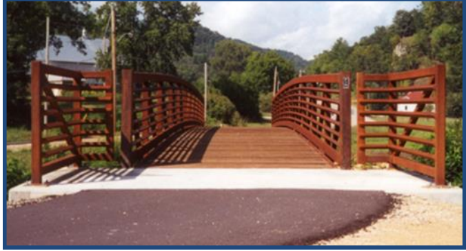
Wheeler PREFABRICATED STEEL BRIDGES