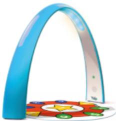
YA3525 (one color)

The Yalp Sona caps, inner metal top cover and metal inner caps are available in all RAL colors and combinations. The striped color polyester caps have a maximum of 11 stripes.