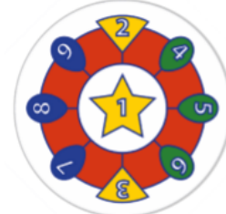
YA3528 (non infill)