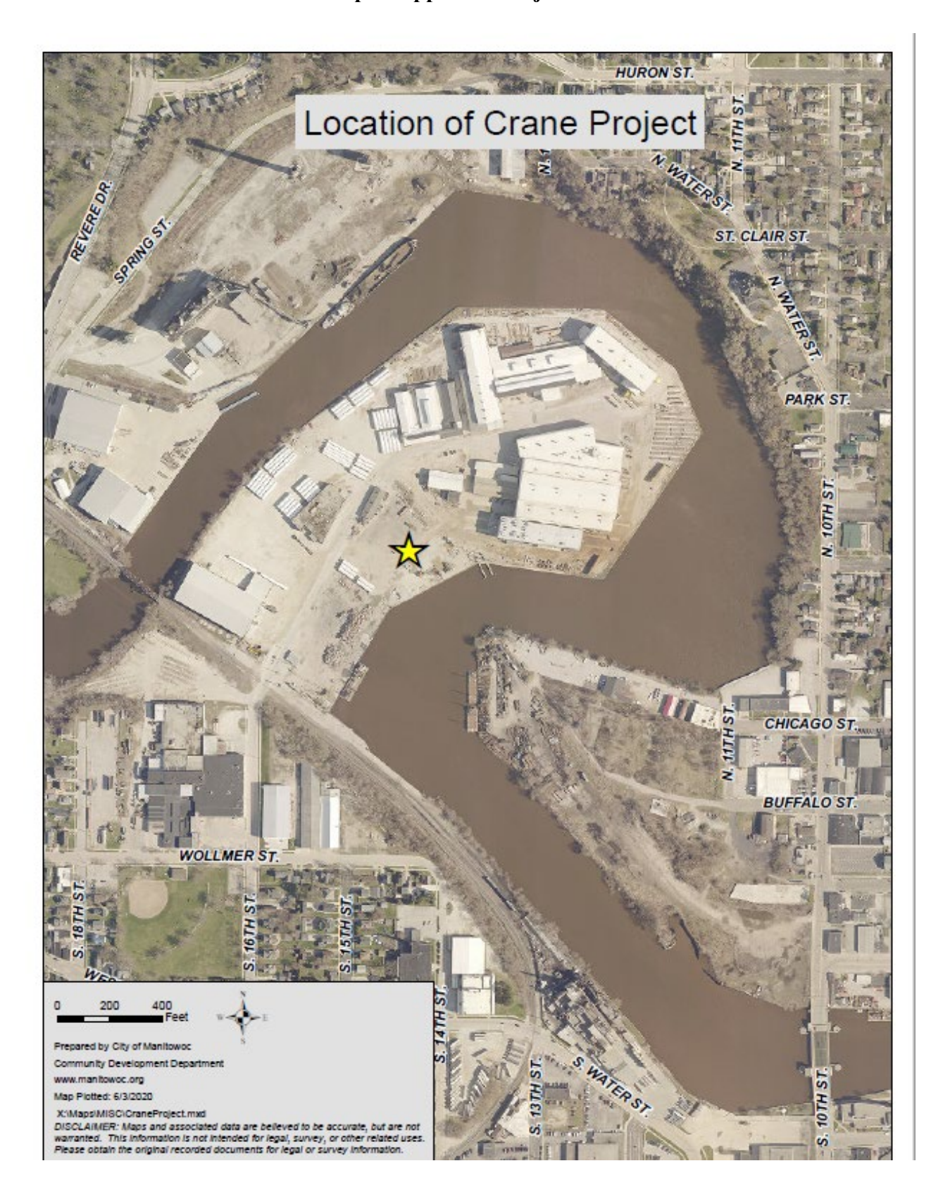
ATTACHMENT A - Cont'd - Map of Approved Project Area