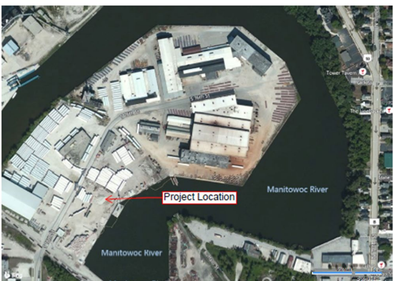
ATTACHMENT A – Map of Approved Project Area