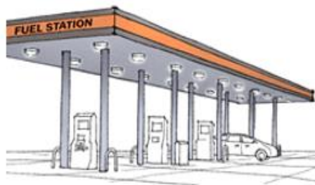
A example of a fuel canopy

(5) Multi-Tenant Commercial Building with Single Entrance. A building with a single entrance serving multiple businesses may place a business directory on the wall, provided: