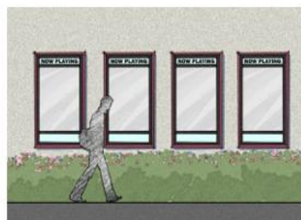
An example of movie theater placards

(f) Permit requirements: sign approval is subject to staff review only, no permit is required.