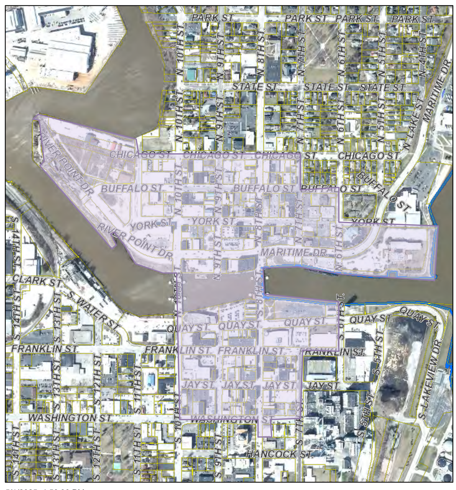
EXHIBIT A - DORA