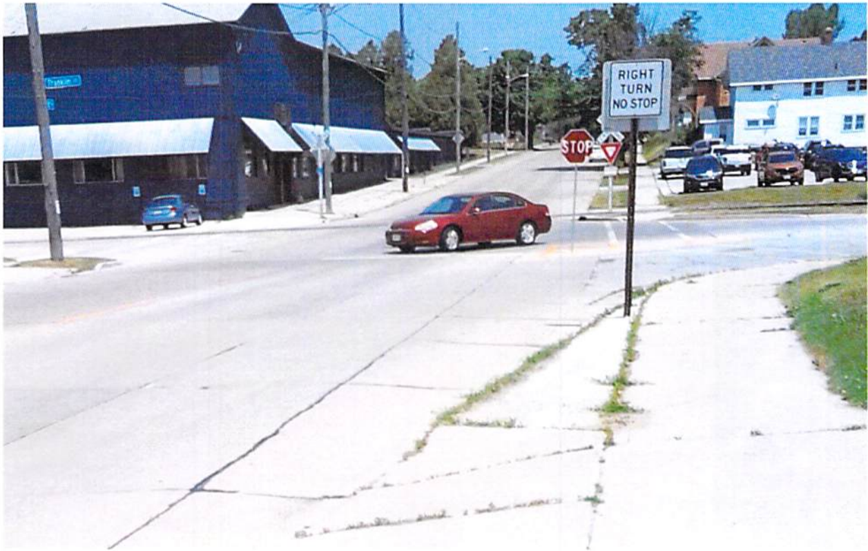
Vehicle comes from W/B Franklin Street into intersection with 26 th Street and proceeds S/B on 26th