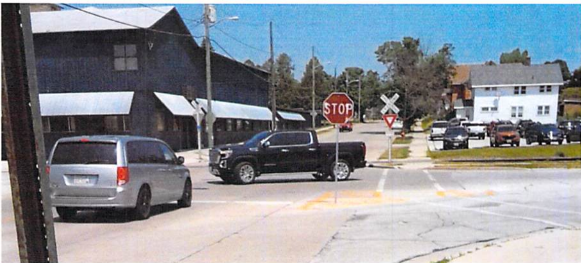
Vehicle N/B on 26 th Street has to wait for W/B Franklin Street Traffic to clear the intersection.