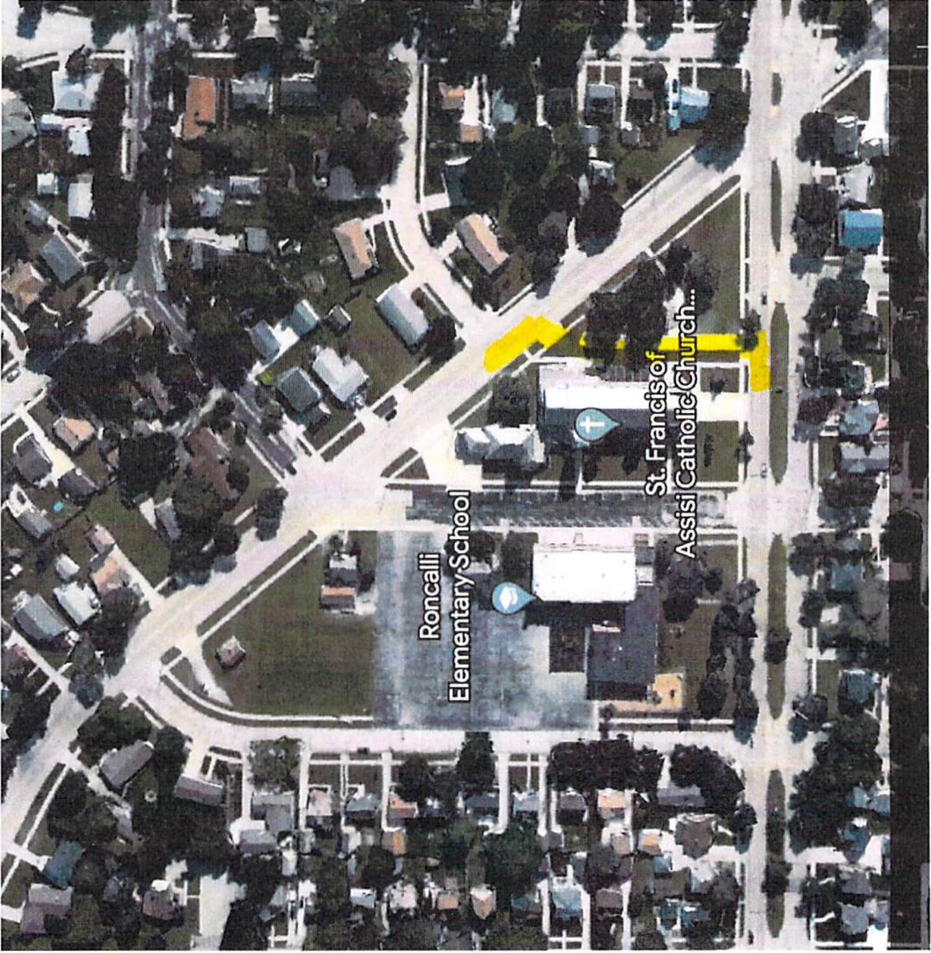
[Yellow Highlight] Shows Drive-thru for Fish Boil (Friday)