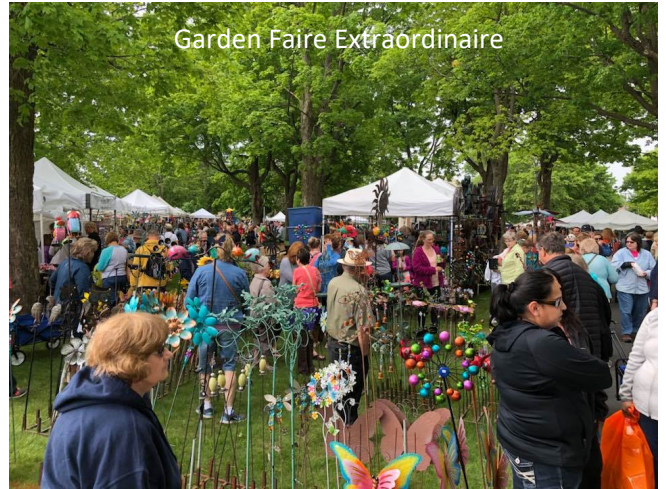
Garden Faire Extraordinaire