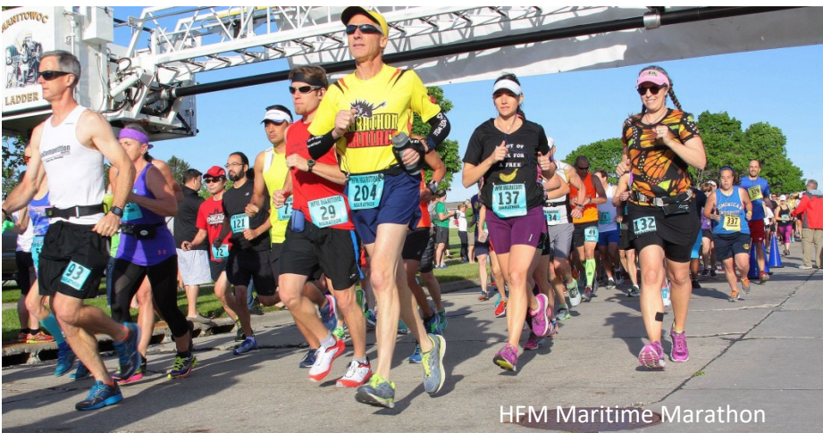
HFM Maritime Marathon