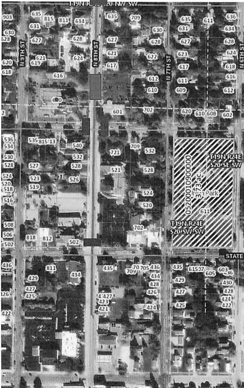
Rahr West Art Museum Charitable Foundation Event 7/18/24